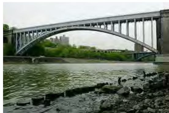
High Bridge-Bronx, New York

Draw a bridge. It can be anywhere, go to any place. This may be a bridge you have seen in person. It may be a bridge you would like to see or it may be a bridge that you have imagined.